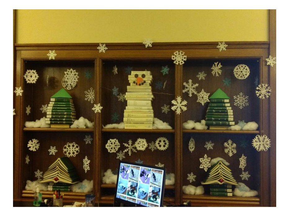
ORALL Newsletter March 2018 Page 7