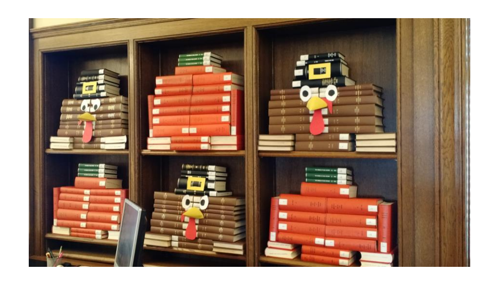
ORALL Newsletter December 2015 Page 12