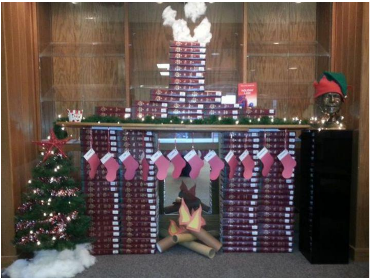
A Book Holiday Hearth with Fireplace

Last year after creating a small tree display (due to space issues I needed it to be small) I started thinking of other holiday book displays I could create that would catch the eye of a passing student and hopefully bring them into our library. The space in our library entrance is not conducive to a large display that would take up a lot of square footage, so I had to come up with something that would not block or cause problems with traffic flows. Another important element to these displays is identifying parts of your collection that is seldom used and would not cause a problem if used in such a display for a month or more. To this end, 118 volumes of our no longer updated, brick red in color, Atlantic Digest 2d series came in handy. The response thus far has been wonderfully positive! I hope that this display gets your creative juices flowing and prompts some display ideas for your library. Please share them with me at lisa.britt@uc.edu .