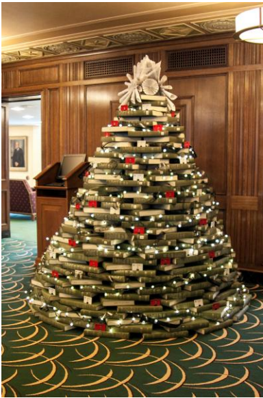
(The Supreme Court of Ohio Law Library)