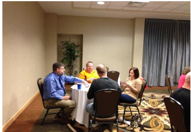
The quiet group of game night