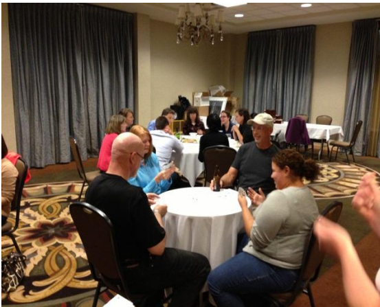
The rowdy crowd of game night