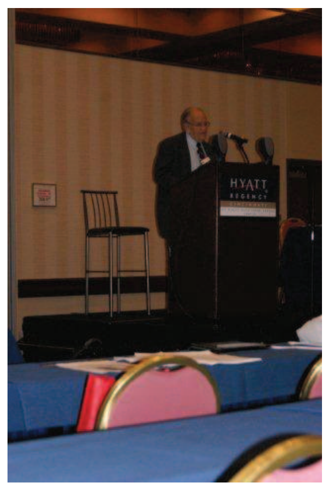
ORALL Newsletter December 2011 Page 7