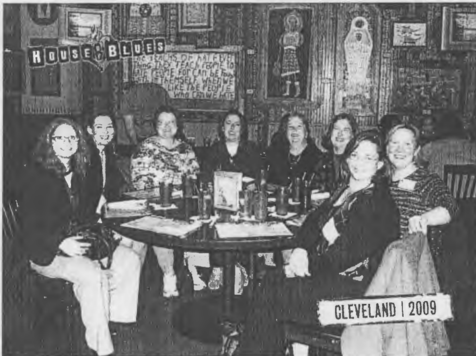
House of Blues Dine-Around