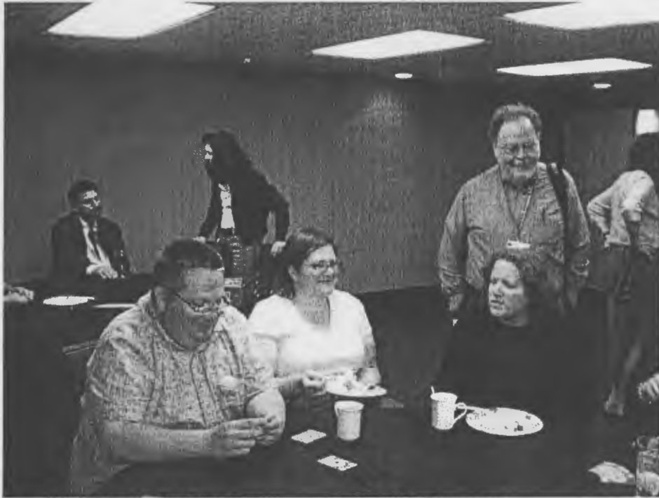
Game Night (and Cake!)