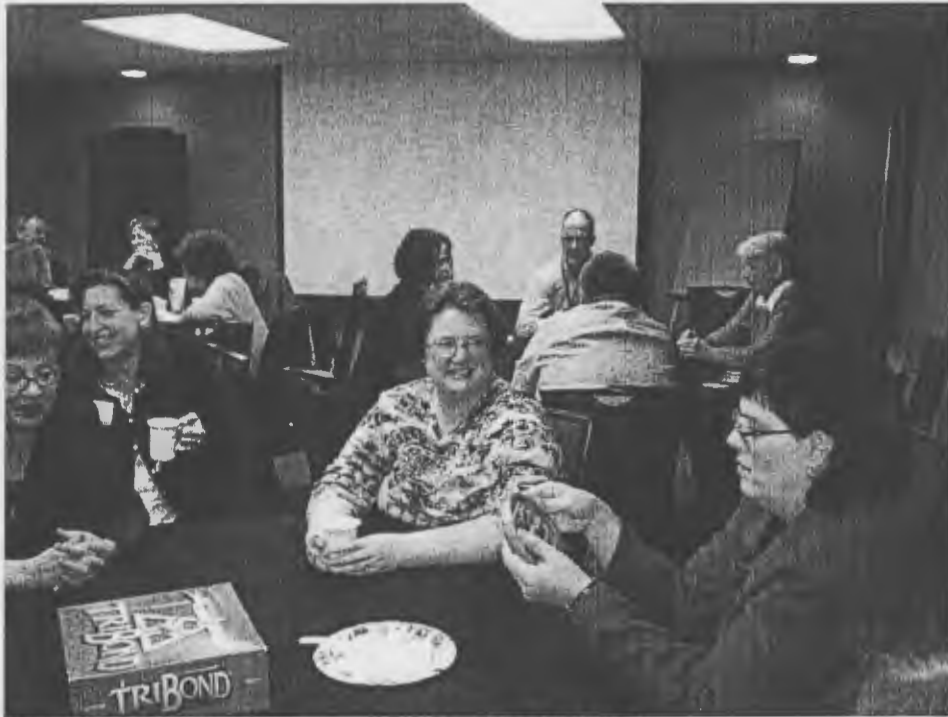
More Game Night