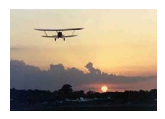
Fifty-Ninth Annual Conference October 15-17, 2008

Congratulations and thanks to the many ORALL members who helped to make the 2008 ORALL Annual Meeting in Dayton a success!