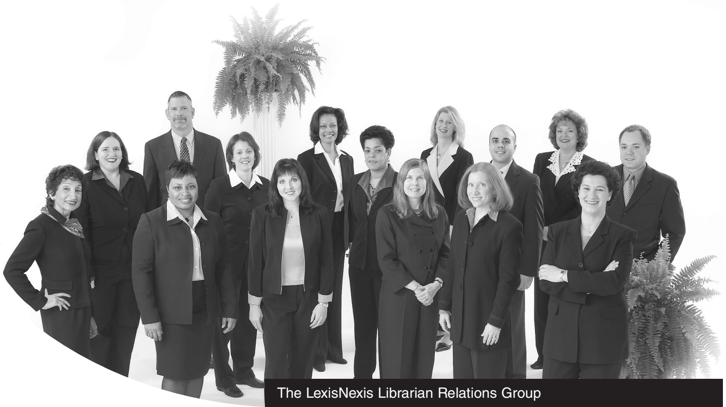
The LexisNexis Librarian Relations Group