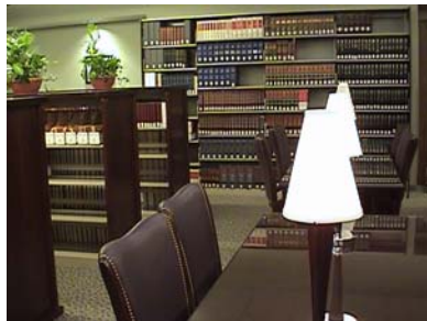
Wired Group Study Tables

Construction on the new Lake County Law Library began on January 26, 2004, sixteen years after the idea was first broached. The Library Board was very adamant about making the Lake County Law Library technologically advanced without alienating our print patrons. Because of online resources the library experienced a yearly decline in actual visits. Our challenge was to bring people back to the library for other reasons. We began by investigating wireless access in the library. In 2002 we had planned for extra electric and data outlets to accommodate laptop users, but in 2004 we took the next step with wireless access.