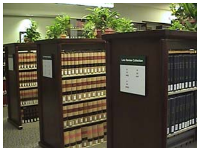
Law Review Area

On July 26, 2004, exactly six months from the start of demolition, the movers arrived. The previous library had been housed in a space that consisted of four rooms equaling 2800 square feet. Thanks to the convenience of compact shelving we now reside in a one room space of 2500 square feet. With the exception of a weeding project that took place in 2001 no other print titles had to be discontinued and we have at least five years of growth.