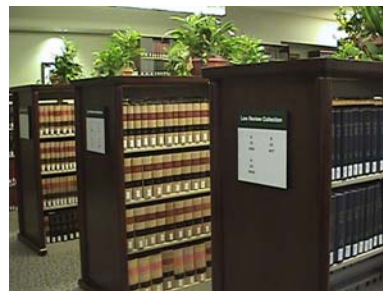
Space-reducing Compact Shelving

Any ORALL member visiting the northeast corner of the state should consider this an open invitation to stop in and take a tour.