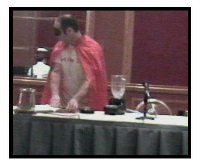
KeyCiteMan to the rescue, with a blender!?! It must have been Friday.