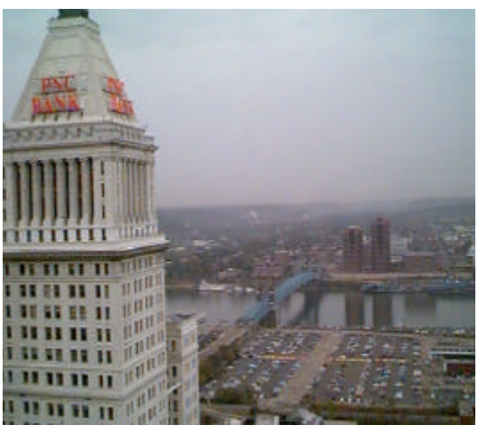
Cincinnati Riverscape from Scene of ORALL Annual Meeting, October 1997