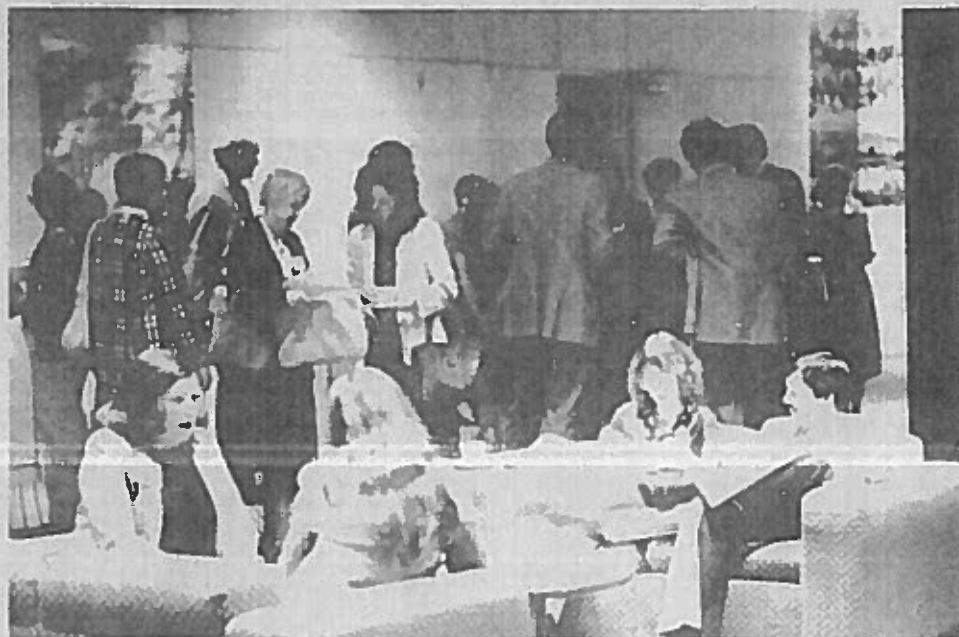
Besides enjoying the social activities, ORALL members intently exchanged information and ideas during the Spring Meeting in Cincinnati.